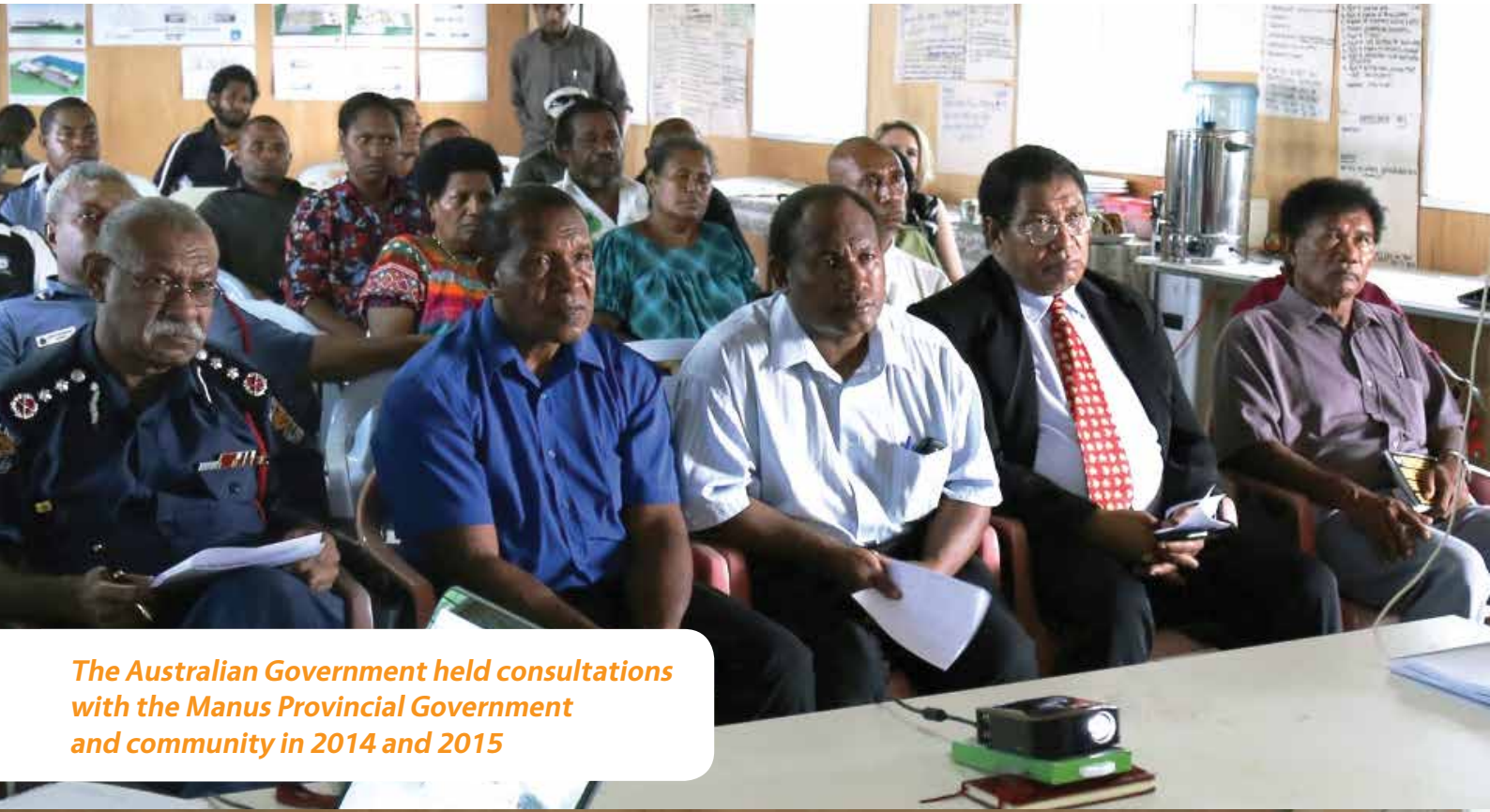
The Australian Government held consultations with the Manus Provincial Government and community in 2014 and 2015

As part of the redevelopment, the existing buildings will be demolished and a temporary station will be set up in Lorengau town.