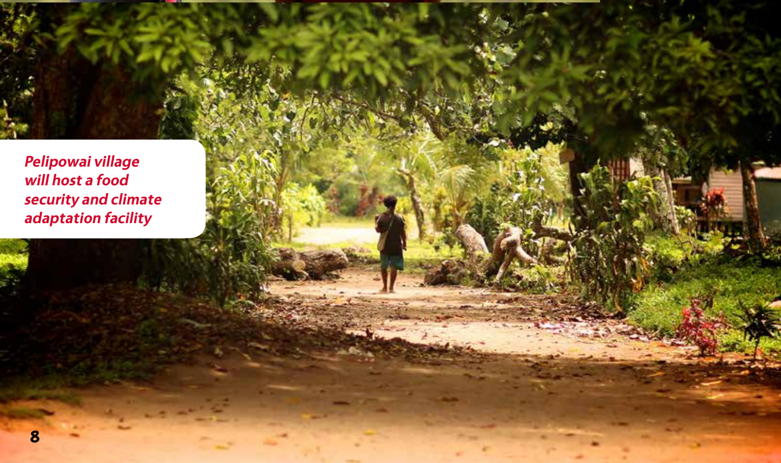
Pelipowai village will host a food security and climate adaptation facility