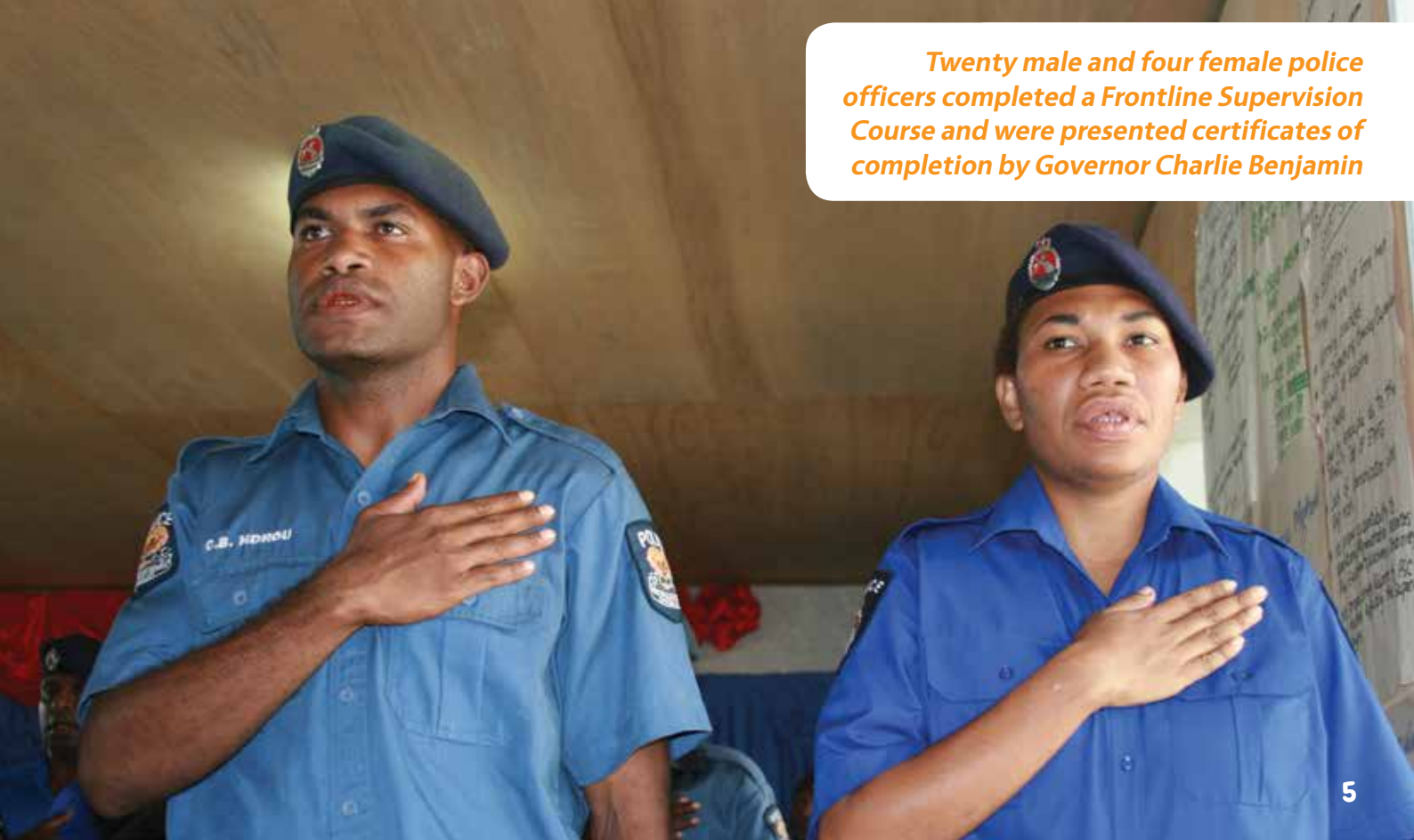
Twenty male and four female police officers completed a Frontline Supervision Course and were presented certificates of completion by Governor Charlie Benjamin