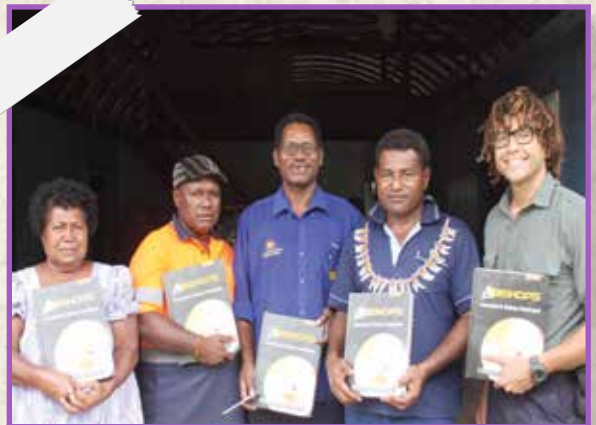
Transfield Sekyuriti i givim ol safeti buk i go Manus Trenin Senta. Safeti buk bai soim ol wok man na meri na tu ol sumatin long wei bilong lukautim na banisim ol taim ol i usim ol masin long trening na wok.