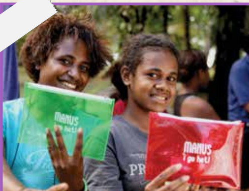
KLO Emily i bin go raun long ol komuniti long Manus na givim ol Manus i go het pensil case, liklik pilai bol, kala pensil na rula.