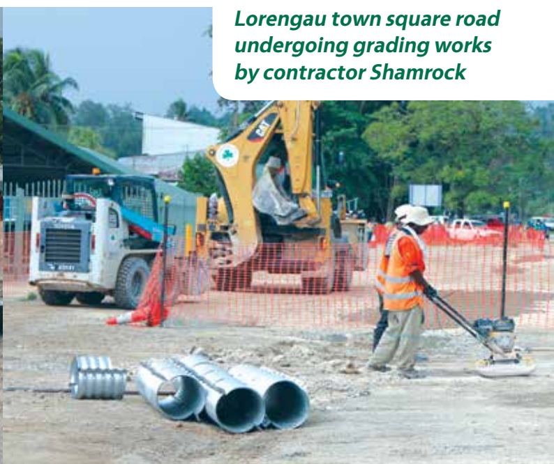
Lorengau town square road undergoing grading works by contractor Shamrock