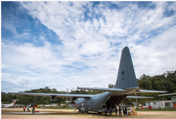
The RAAF C-130J delivering supplies to the earthquake-affected Highlands

AUSTRALIA IS SUPPORTING PAPUA NEW GUINEA IN ITS RESPONSE TO THE EARTHQUAKE IN HELA, SOUTHERN HIGHLANDS, WESTERN AND ENGA PROVINCES